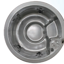
GENEVA 24 265 US gal (1007 L) · 75.75 (diameter) x 36 in. (192.4 x 91.4 cm)