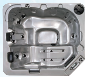
KAUAI 280 US gal (1064 L) · 72.5 x 81 x 30 in. (184.2 x 205.7 x 76.2 cm)