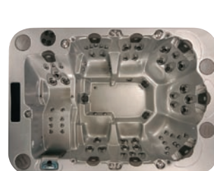
MIRAGE 680 US gal (2574 L) · 132 x 92 x 40 in. (335.3 x 238.8 x 101.6 cm)