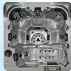
LANAI Soundwaves™ 410 US gal (1558 L) · 90 x 90.5 x 40 in. (228.6 x 229.9 x 101.6 cm)