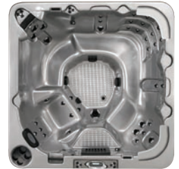
TAHITI 385 US gal (1463 L) · 82.25 x 82.25 x 40 in. (208.9 x 208.9 x 101.6 cm)