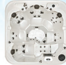
HELIOS 384 US gal (1454 L) · 92 x 92 x 40 in. (233.7 x 233.7 x 101.6 cm)