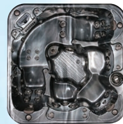
UNITY 310 US gal (1173 L) · 92 x 92 x 40 in. (233.7 x 233.7 x 101.6 cm)