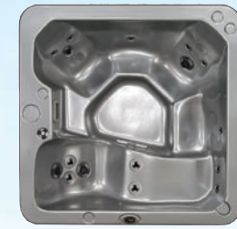
ISLANDER 265 US gal (1007 L) · 76.5 x 76.5 x 30 in. (194.3 x 194.3 x 76.2 cm)