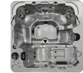
WAILEA 430 US gal (1596 L) · 91.5 x 91.5 x 40 in. (232.4 x 232.4 x 101.6 cm)