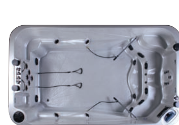
WELLNESS II™ 1667 US gal (6312 L) · 90 x 151 x 53 in. (228.6 x 383.5 x 134.6 cm)

Note: All measurements are approximate. Please consult your Coast Spas dealer for details.