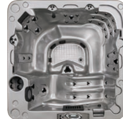
PARADISE 380 US gal (1425 L) · 81 x 81.5 x 40 in. (205.7 x 207 x 101.6 cm)