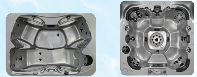
ARUBA 180 US gal (684 L) · 59.5 x 83.5 x 30.5 in. (151.1 x 212.1 x 77.5 cm)