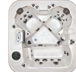
QWEST 275 US gal (1041 L) · 82.1 x 77.3 x 38 in. (208.6 x 196.3 x 96.5 cm)