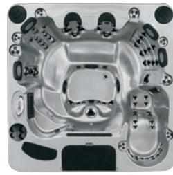
EXTREME 480 US gal (1824 L) · 95 x 95 x 40 in. (241.3 x 241.3 x 101.6 cm)