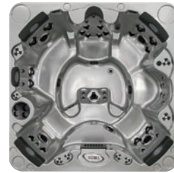
MANHATTAN 440 US gal (1665 L) · 91 x 91 x 40 in. (231.1 x 231.1 x 101.6 cm)