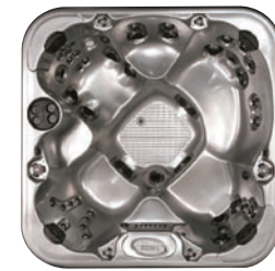
ZENITH 290 US gal (1098 L) · 81.5 x 81.5 x 40 in. (207 x 207 x 101.6 cm)