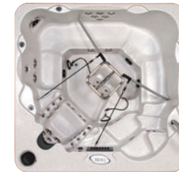
WELLNESS™ 592 US gal (2241 L) · 96 x 96 x 45 in. (243.8 x 243.8 x 114.3 cm)