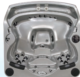
CASCADE 450 US gal (1710 L) · 94.5 x 96.5 x 40 in. (240 x 245.1 x 101.6 cm)