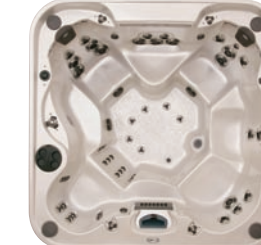
RADIANCE 425 US gal (1612 L) · 92.31 x 91.94 x 40.25 in. (234.5 x 233.5 x 102.2 cm) 47 in. at back (119.4 cm)†