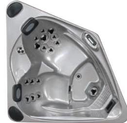
DIAMOND 100 US gal (380 L) · 69.75 x 93.25 x 29.5 in. (177.2 x 236.9 x 74.9 cm)